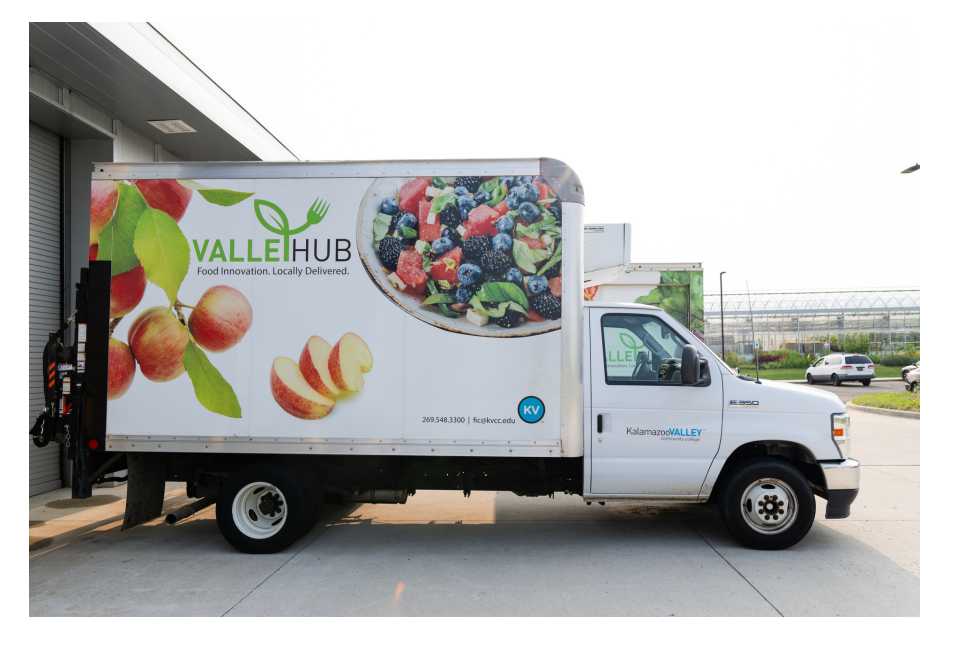
Photo at left: A delivery truck at ValleyHUB, Kalamazoo Valley Community College's food hub. ValleyHub works with local farmers and institutions, like schools, to make the local food procurement process streamlined.