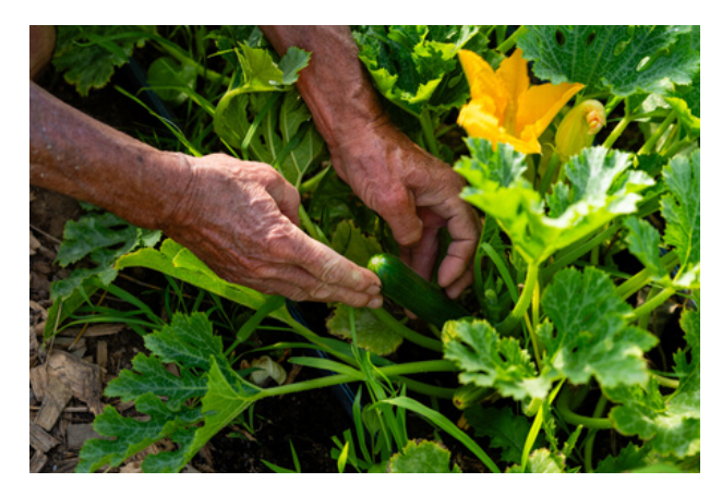
Photo above: Harvesting summer squash at Hillcrest Farms in Eaton Rapids, Michigan.