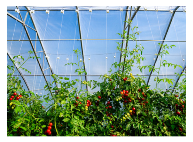
Photo above: Tomatoes growing in the greenhouse at Detroit Public Schools Community District's on-site farm, Drew Farm.