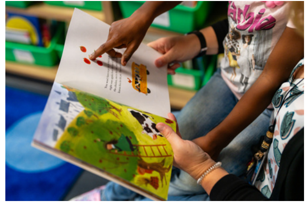
Photo above: Nutrition education celebrating local apples at Comstock Public Schools in Kalamazoo, Michigan.